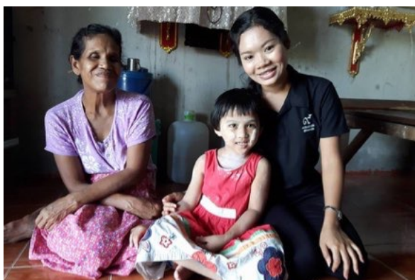
Home visits: help teachers see their students in their home environment and frequently understand the struggles particular families are having.