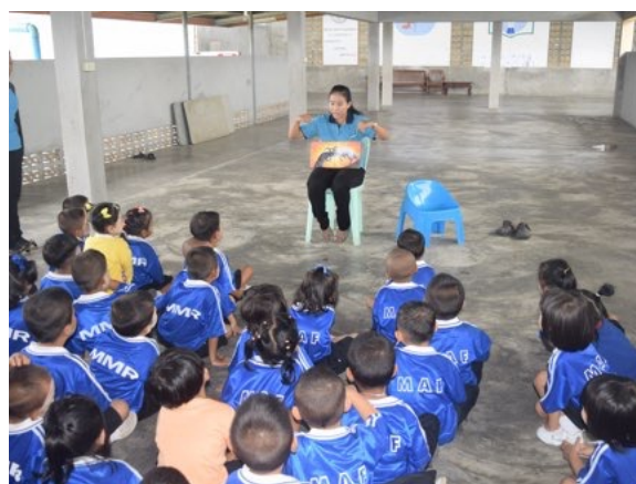
Creativity: Story telling, arts and crafts, music and games help students to enjoy the start of their education journey.