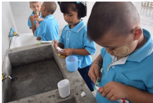
Hygiene: children learn healthy living skills with daily washing, cleaning teeth and personal hygiene practises.