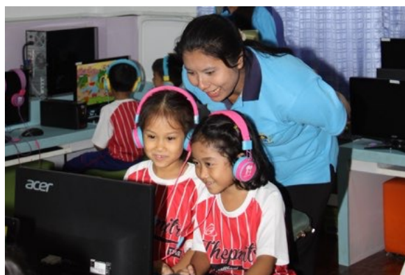
Teacher Training: visiting other Learning Centres and Schools provides our teachers with experiences to apply to their own teaching styles. New experiences brings new resources and new teaching ideas

Summary 6 month financial report attached May - October 2016