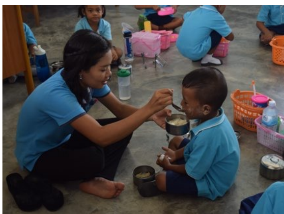
Nutrition: Teachers take special care to identify hungry students and everyone eats and shares food together in small groups.