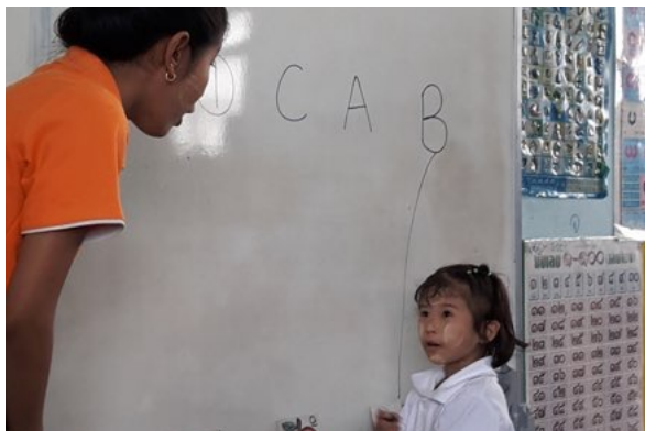
Learning: Children learn their first language, Burmese, but also learn Thai and English alphabets and songs